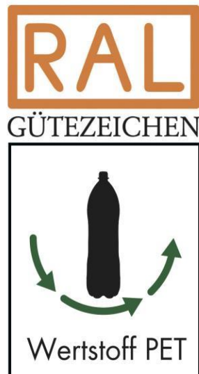
Beverage container using recyclates

As shown in the following image, quality-certified products/services are tagged with the certification mark of the quality association, along with an additional service-related phrase: