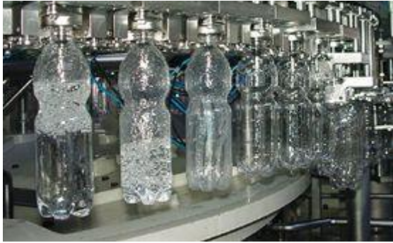
Figure 3-3: Filling system

The output of the bottle is defined at the end of the overall process: The filled beverage bottles are tagged or imprinted with seals and labels.